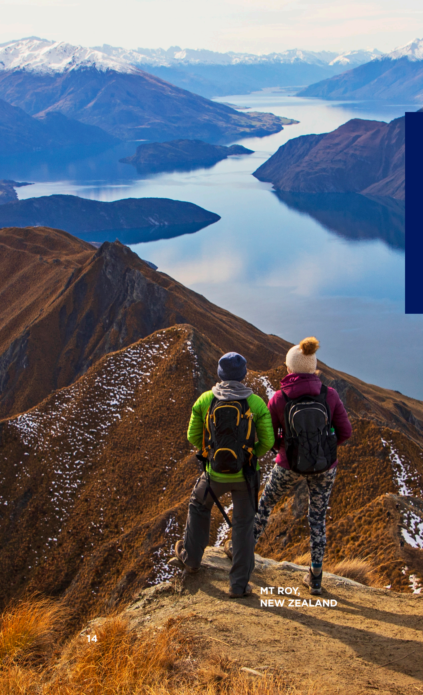
MT ROY, NEW ZEALAND