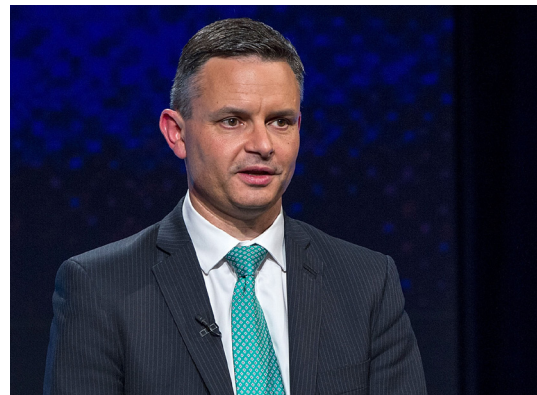
- James Shaw, New Zealand Minister for Climate Change

It is fair to say Article 6 is especially important for nations such as New Zealand, for whom delivering the 2050 net-zero emission goals within their own borders is already impossible.